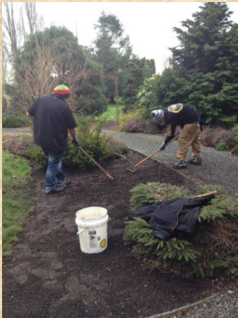
Youth at Work

In January 2012, the Assistant Administrator of Juvenile Court Operations asked two Detention Alternatives juvenile community correction officers to research gender responsive programming and how it could affect the juvenile justice-involved youth in Snohomish County. After the need for this type of programming was identified, Journey was born. Superior Court obtained grant funds from the State of Washington and the Tulalip Tribes to send two employees to train on the Once Circle Foundation's Girls Circle program. In the three sessions we held, Journey served 21 juvenile justice-involved girls. Of those 21 girls, 18 successfully completed and stated they had a high level of satisfaction with the class. Using the girls' positive response to Journey, coupled with the current research on juvenile justice involved girls, staff partnered with Pierce County, King County and the University of Washington Research and Development to develop and research a more evidence-based gender responsive program. GOAL (Girls Only Active Learning) is based on the cognitive behavior triangle and is designed to teach girls' skills and reframing techniques for their thoughts, feelings and behaviors. Snohomish County and Pierce County will run a pilot of GOAL simultaneously beginning in March, 2015.