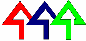
Table of Contents SNOHOMISH COUNTY MONTHLY FINANCIAL REPORT