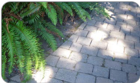
Modular pavers work great for parking lots, patios and walkways.

Modular pavers are typically installed over base layers of sand, gravel, and rock. The space between pavers are typically filled with washed coarse sand or pea gravel, though some are also designed for vegetation. Pavers typically have a spacer that ensures the ideal distance between pavers is maintained for maximum infiltration. An example installation of modular paver is shown in the adjacent diagram, but exact materials and depths vary. Follow the recommendations specified by the manufacturer for your paver installation. Pavers can be used in high use area such as parking lots, patios and walkways.