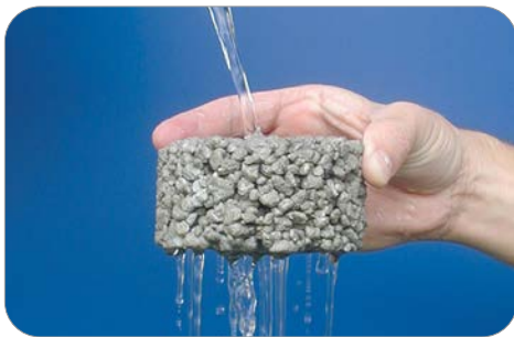
Permeable pavement allows water to seep through and be naturally filtered by the soils below.

Permeable pavement should be located a minimum of 2 to 5 feet above the seasonally high groundwater table and at least 100 feet from drinking water wells. Ideal uses include walkways, residential parking areas and driveways.