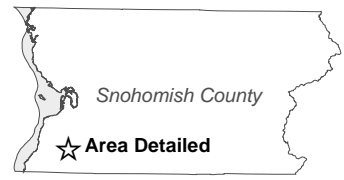
Figure 1. Project Vicinity