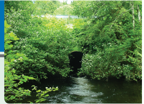
A new 20-foot concrete culvert will replace the existing culvert at milepost 8.

Commuters traveling through the area should expect delays of up to 20 minutes.