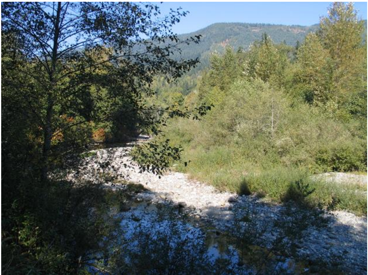
A part of the Whitehorse Trail.

A nonprofit, Forterra secures and cares for the keystone places — wild, rural and urban — that are critical to a sustainable future for the Pacific Northwest. Over its 25-year history Forterra has completed more than 400 land transactions encompassing 250,000 acres with more than $500 million in value.