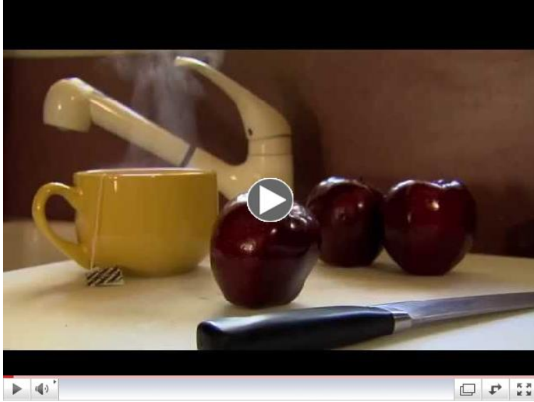
Celebration of Food Festival