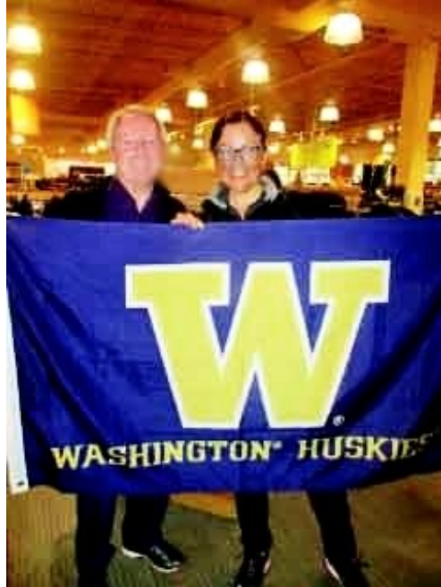
At the UW Bookstore on Small Business Saturday