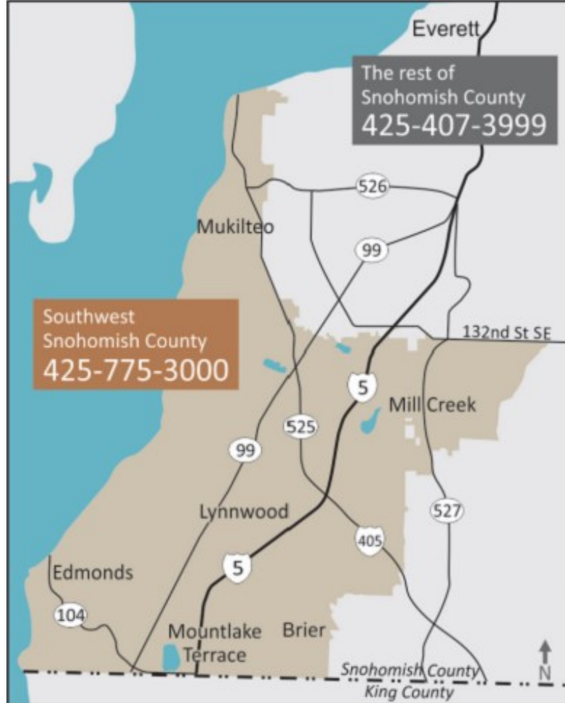
Non-Emergency 911 telephone number map

To use your address to look up the appropriate non-emergency number as well as the non-emergency contact information for your local fire and police agencies, please visit: