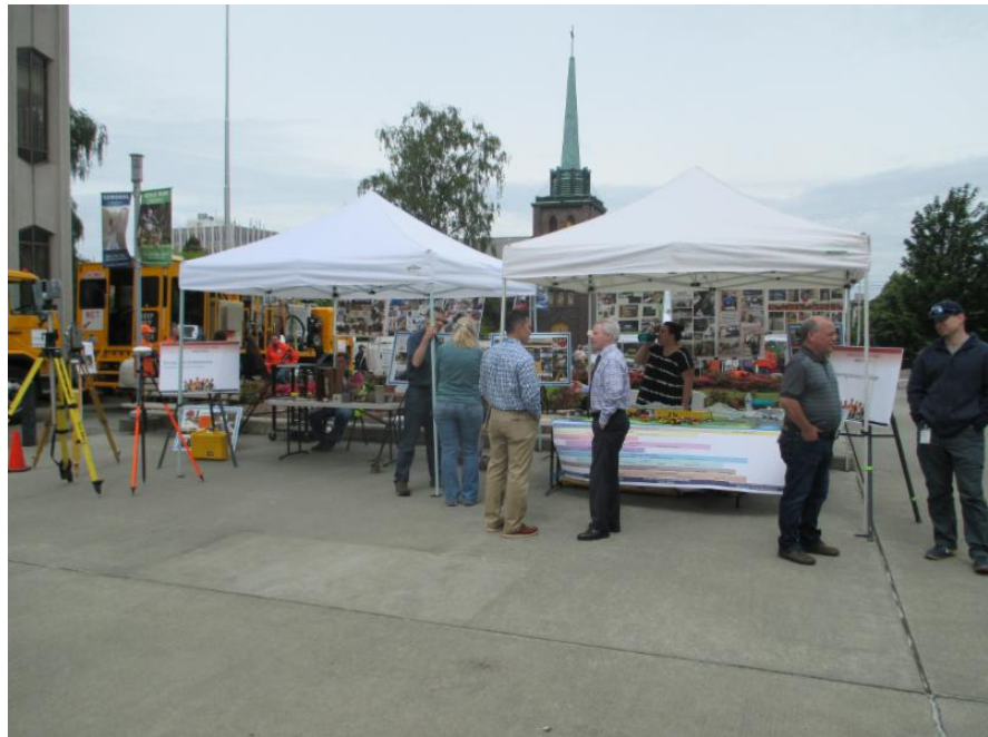
Exhibits and trucks from SnoCo Public Works

Snohomish County celebrated National Public Works week on Wednesday, May 18. In the Snohomish County Plaza, our Public Works Department presented a sampling of its trucks, technology and equipment used to keep the county moving. Employees were on hand to talk about Transportation & Environmental Services, Engineering Services, Surface Water Management, Road Maintenance and Solid Waste. It was an educational experience for everyone.