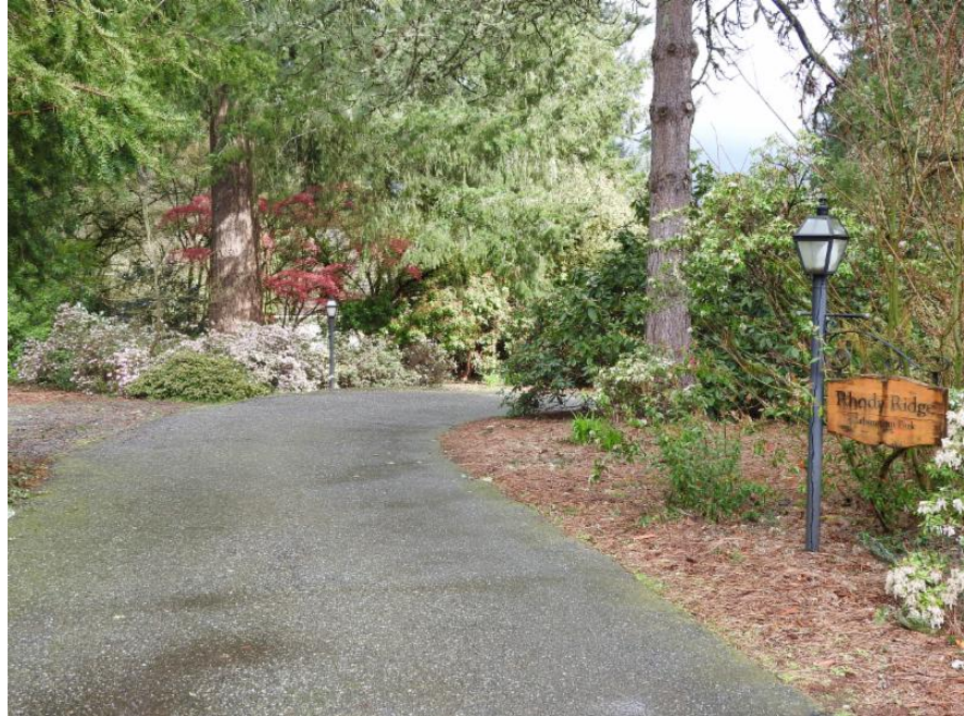
Rhody Ridge Arboretum