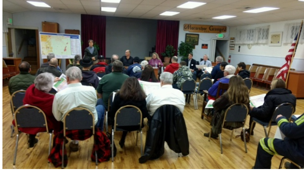
January 2017 meeting with the Clearview Community Association

Over the last three years, I have attended many community meetings throughout my district. I always enjoy meeting and helping our residents.