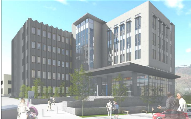
Current rendering of the Courthouse and Addition.

(Screen capture from CBRE Heery drawings.)