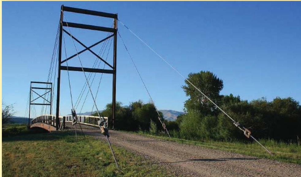
Single-lane cable bridge in Montana