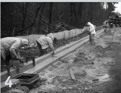
The crew spent a lot of time in small and large trenches working on the drainage system and utility lines.