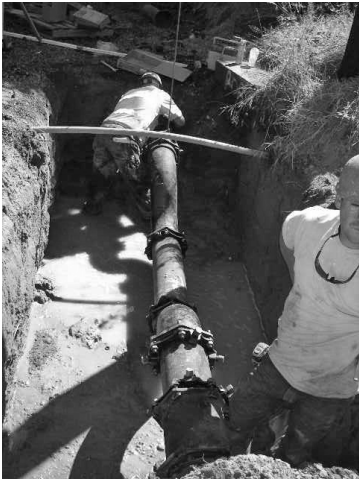
Crew members are knee deep in muddy water while working on a water line.