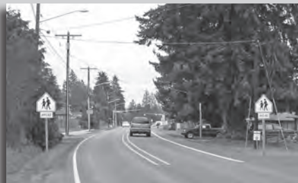
Additional advisory signs shown above have been installed on North Road in advance of the school.