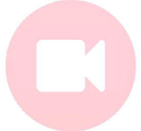
Videos to Watch