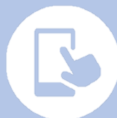
Photo Stuff with RUFF: https://pbskids.org/apps/photo-stuff-with-ruff.html

The Cat in the Hat Invents https://pbskids.org/apps/the-cat-in-the-hat-invents.html