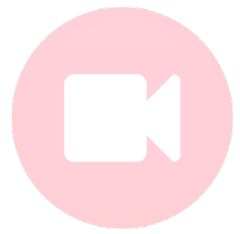
Videos to Watch