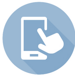
Try these APPs