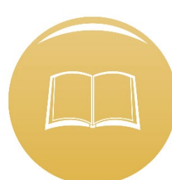
Play & Learn Websites